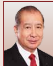
李國寶博士 東亞銀行有限公司 主席兼行政總裁 Dr. The Hon David K P Li GBM GBS JP FHKIB Chairman & Chief Executive The Bank of East Asia, Limited