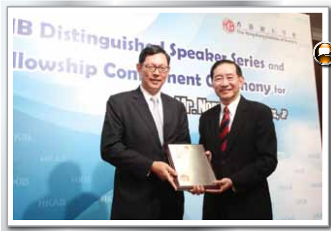
香港金融管理局陳德霖先生（左）接受香港銀行學會會長王冬勝先生頒授「香港銀行學會資深會士」卷軸。

Mr. Norman Chan (left) of the Hong Kong Monetary Authority received the HKIB Fellowship scroll from Mr. Peter Wong, President of HKIB.